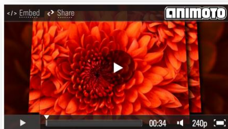
Above: An example of a video slideshow created in 'Animoto' and embedded in a Moodle page